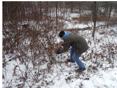
Cutting brush back trailside.