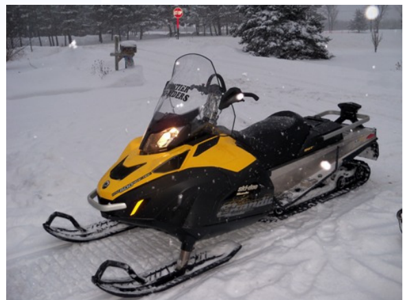
Frontier's Newest Groomer - 2013 Skandic