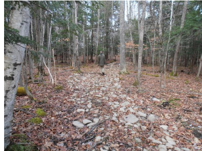
Stone paved over wet spot.