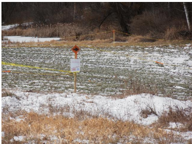
Planted field rerouting signs.