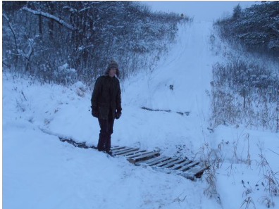
Pallets placed in water hole.

(518) 469-0251 ■ 120 Catherine St., Albany NY 12202